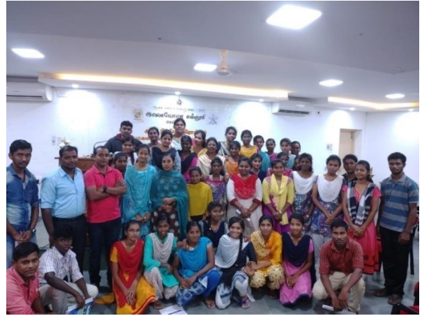
Human Rights day Orientation - Loyola College – Mettala.