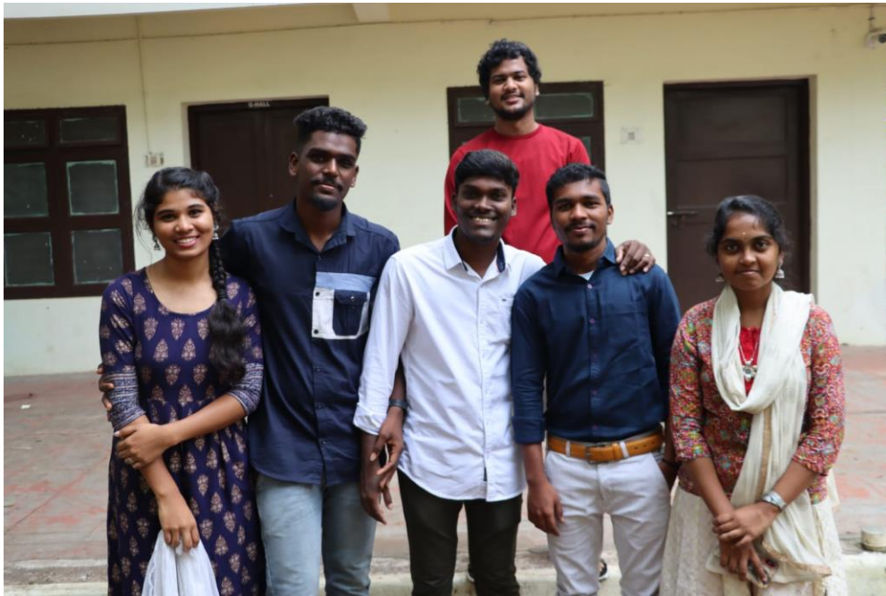
National council members meeting – TN AICUF House, Chennai.