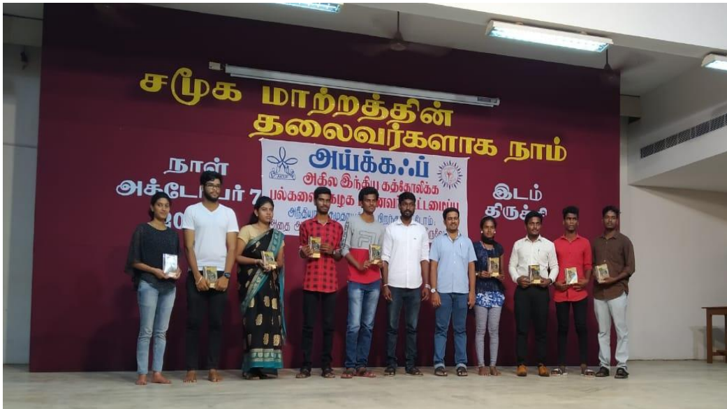
Leadership Training Programme - St. Joseph's college – Tiruchirappalli.