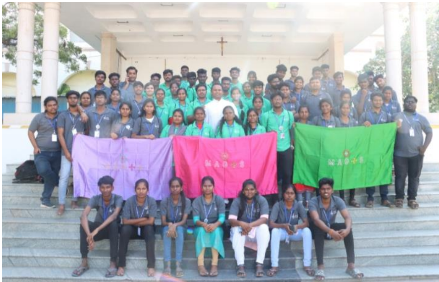
MAGIS'23 – TN AICUF House, Chennai.