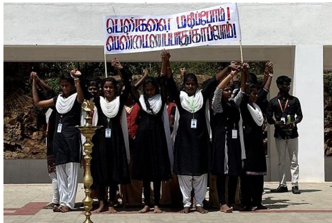
Women Empowerment - Street play – Loyola College – Mettala