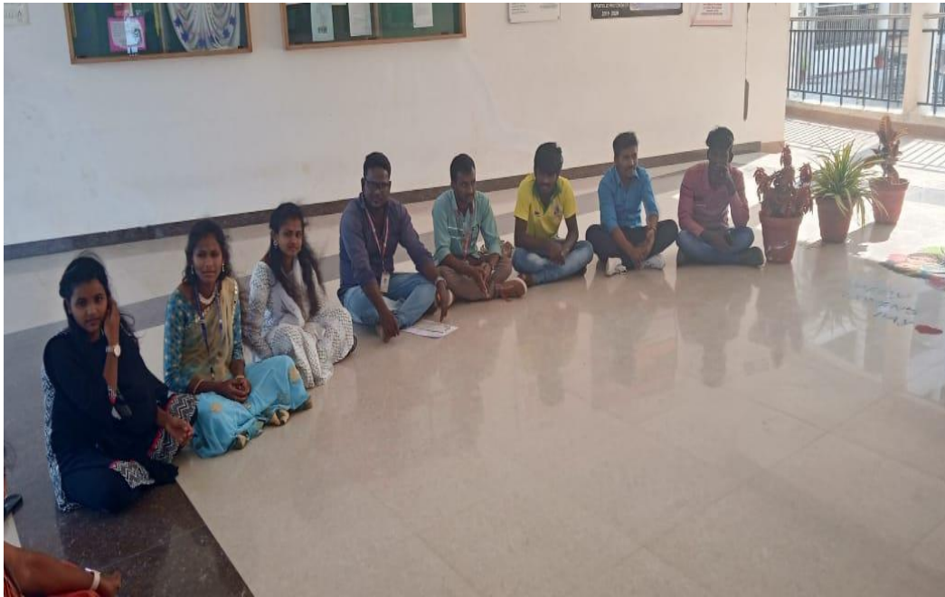
Unit members meeting – Loyola college – Mettala.

On 8 th December, 2022 LCM AICUFers and Unit Advisors were discussed about Dr. Ambedkar's life story & Babri Masjid demolition and Hindu – Muslim riot on that day.