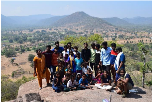
Field work with Tribal people at Sathiyamangalam.