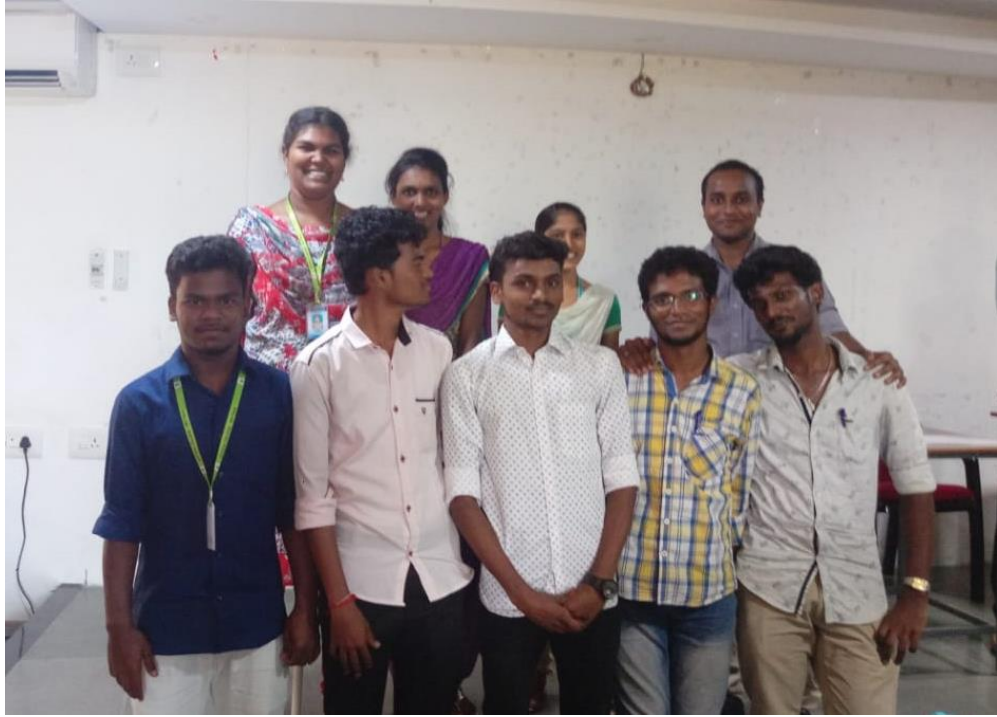
State Council Election – Loyola College - Mettala