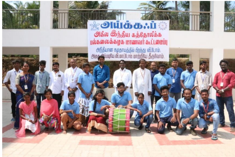
Street play I - Loyola college – Mettala.