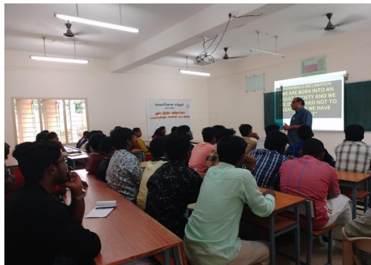
National advisor's visit - Loyola College – Mettala.